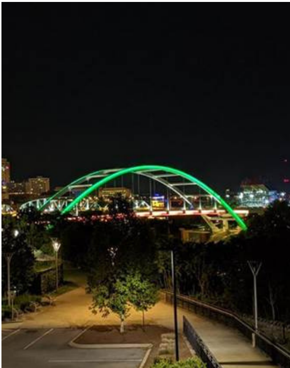
Korean Vet’s Bridge Nashville, TN