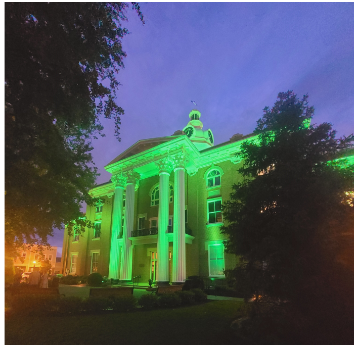
Rutherford County Court House Murfreesboro, TN

In recognition of Children’s Mental Health Awareness Week, TN Voices teams collaborated with city and county government officials to promote the importance of children’s mental health through a series of events across the state. In Middle Tennessee, The Korean Veterans Bridge was lit green, as well as the Big River Crossing, and Hernando Desoto Bridge in West Tennessee. The color green is representative of mental health awareness, and we were honored to have these historic landmarks play a key role in our annual “Go Green” campaign, as well as support from staff in promoting Children’s Mental Health awareness on various social media platforms.