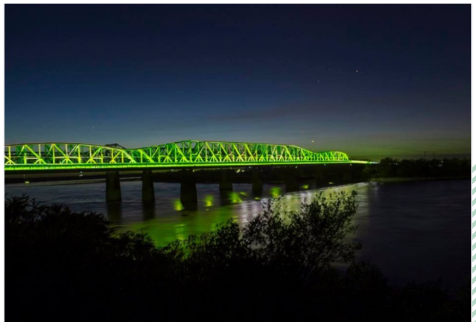
Big River Crossing Bridge Memphis, TN